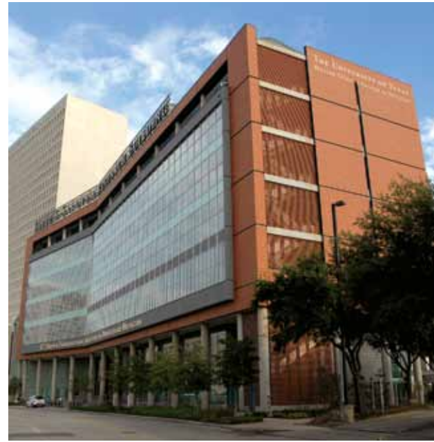
The Brown Foundation Institute of Molecular Medicine for the Prevention of Human Diseases